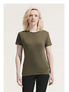
SOL'S REGENT WOMEN 01825