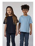
SOL'S Imperial KIDS 11770