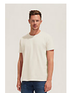
SOL'S Imperial 11500